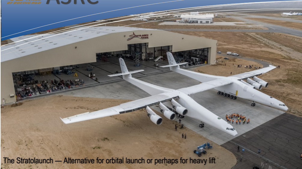
The Stratolaunch — Alternative for orbital launch or perhaps for heavy lift