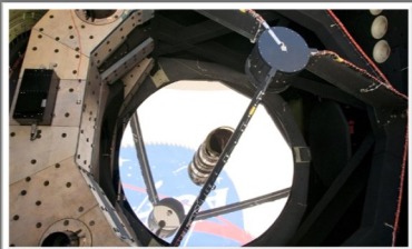
Cassegrain Telescope supplied by German Consortium

This was a novel solution to get a telescope up above the zones where water absorption blocked all the wavelengths of interest to the astronomers who studied the infra-red wavelength range. This required flights at up to 45,000 feet- above 99% of atmospheric water vapour. First light was in May 2010 and it is now retiring after 921 overnight 10 hour science flights