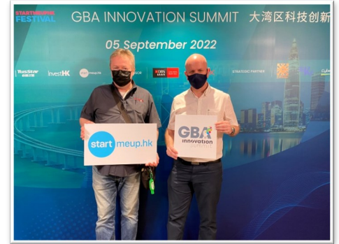
ASRC Staff at the GBA Innovation Summit