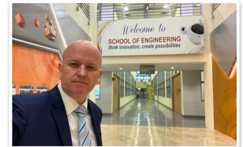
ASRC CEO at Nanyang Polytechnic and the AP-MRO Conference