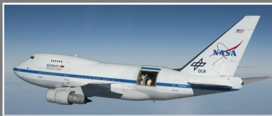
SOFIA in flight

The Converted United airlines short body 747 called SOFIA (Stratospheric Observatory for Infra-red Astronomy) was equipped with a reflecting Cassegrain telescope for NASA by arrangement with a German research consortium. It was not the first airborne observatory but was the most ambitious.